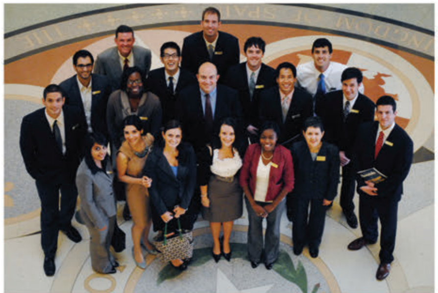
▣ The Class of 2013 and Robbins Institute faculty visit the Texas Hospital Association headquarters and the Texas State Capitol in Austin.

The Robbins MBA Healthcare Program is developing a national reputation one step at a time. After securing funding from the Robbins family, the program was granted accreditation in May 2010 by the Commission on Accreditation of Healthcare Management Education (CAHME). During the program's first U.S. News & World Report ranking opportunity in March 2011, it achieved a top 25 ranking. Looking to the near future, we are incorporating a healthcare administration