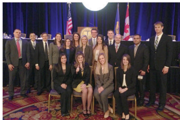
Students in the Robbins MBA Healthcare Program at the Congress on Healthcare Leadership, sponsored by the American College of Healthcare Executives in Chicago IL