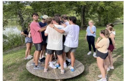
Baylor University Challenge Course