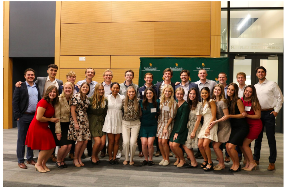
BEST Class 2022-2023