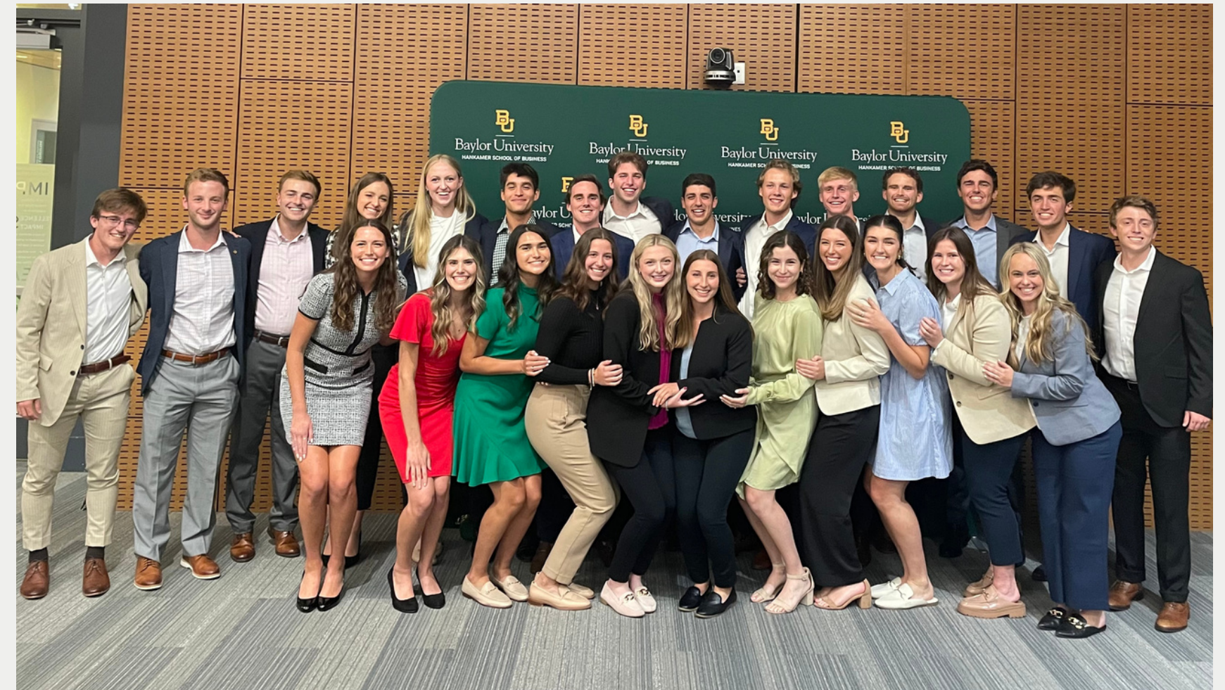
*Current B.E.S.T. Class